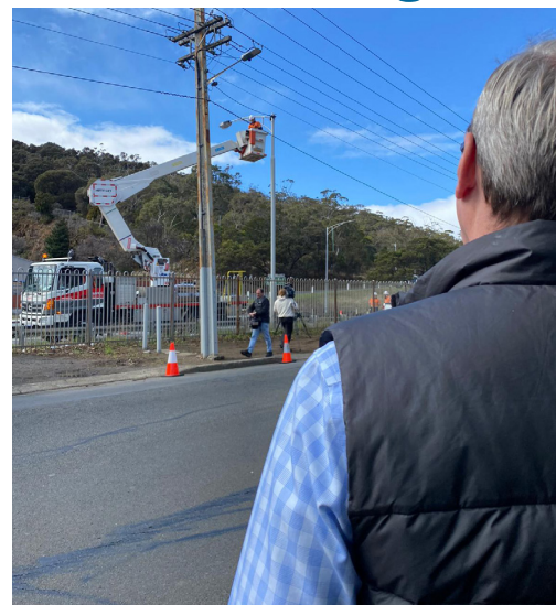
Contributed by Hon. Michael Ferguson, Deputy Premier (pictured).

Isn't that great? So, next time you're out and about, look up and know that the Rockliff Liberal Government is doing our bit for our community and being responsible with our energy resources.